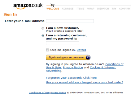
Fig 1. Checkout process designs.

Nordstrom illustrates content in a diagrammatical representation and follows a simple top-down navigation style in which users can freely enter the required information for performing the checkout process. All required information (shipping information, payment information, etc.) is visible in one single Web-page. This design has been selected since it freely enables users to access all steps of the checkout process in a single Web-page and could be related to the analytical approach that Analysts follow.