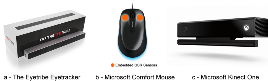
Fig. 2. CogniWin Hardware Components.