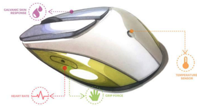
Fig. 1. Mockup Design of CogniMouse.