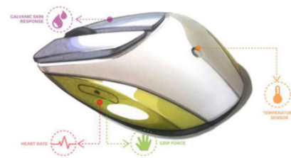
Figure 2. Mockup design of the intelligent mouse.