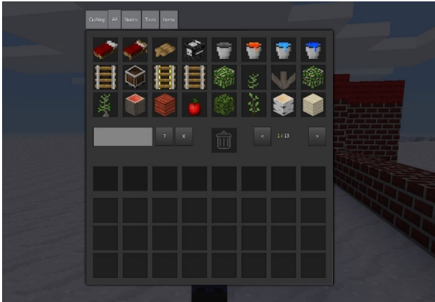
Figure 3 Inventory of available tools and material. The user can choose what he/she needs during the game