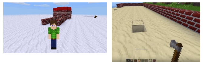
Figure 5 Different worlds in MineTest. A snowy world (left) a desert world (right)

Stage 2: The user is showing activity in an area away from the previously identified problematic situations . At this point the user has understood the environment and is starting to show some consistent activity . The user is activating and preparing his/her inventory .